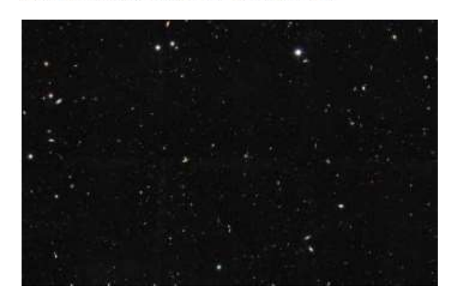
"The Human Body Is A Miracle Of Microscopic Design"

January 16, 2017 by Lindsay Brooke, Royal Astronomical Society