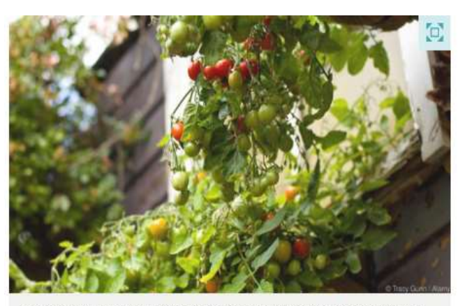
Tomato plants can receive signals from their neighbours